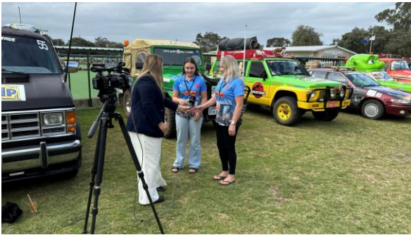
Channel 7 at the Bowling Club